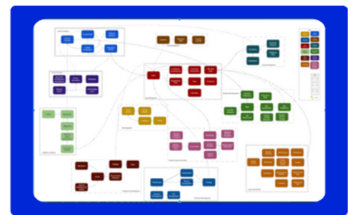
Graphic representation of the Risk Cloud platform with connected use cases.

Today, First Bank of the Lake's GRC team is positioned not just to meet regulatory obligations but to drive operational resilience, business confidence, and strategic value—all powered by a system that evolves as fast as the business it protects.