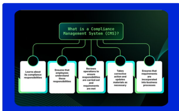
Chart showing the 5 elements of a Compliance Management System (CMS).

FBOL took an agile, phased approach to GRC modernization by first centralizing regulatory workflows in Risk Cloud. They prioritized quick wins by building core compliance processes first, then expanded iteratively into third-party risk, incident management, and audit workflows. By focusing on real user needs, they created a flexible CMS that scaled easily with minimal disruption and strong adoption across teams.